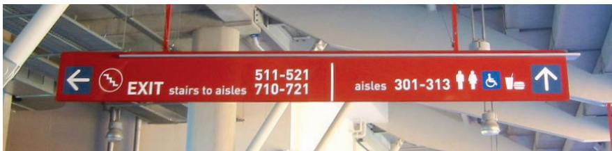
[Above clockwise from top] Identification signage for ticket office and gate, freestanding gate information pylon, internal directional signage, facility signage, [left] directional wall graphics.