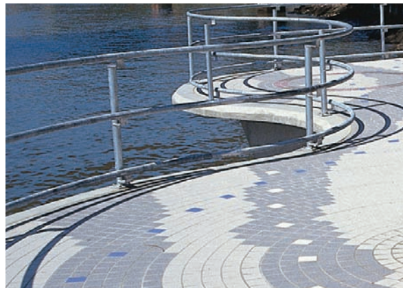
[Clockwise from top left] information map sign, identification sign, public art procurement, and paving patterns.