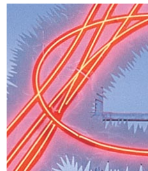
[Clockwise from top] exterior identification signage, interior illuminated identification signage, detail exterior illumination, facility wall signage, and site map.